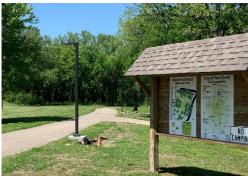
Figure 2. Riverfront Park Trail Lighting

Finding #2: 58% of survey respondents saw room for improvements with adequate street lighting.