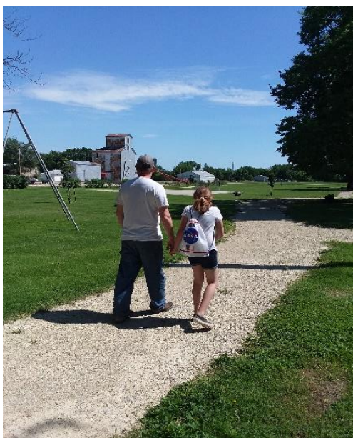
Figure 2. Woodbine, KS Walking Path