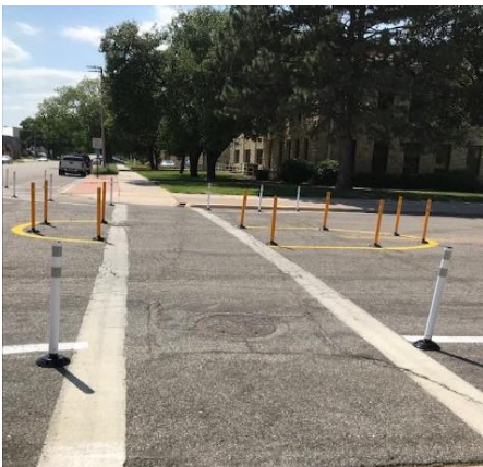
(Figure 2) 7 th & Jefferson Bike Blvd. Demonstration Project

About 40% percent of respondents felt that there are insufficient sidewalks or bike paths in our community.