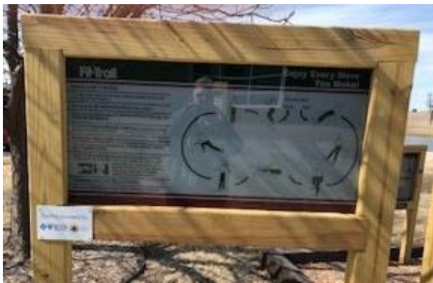
Figure 1: Newton Medical Center Fit Trail Entrance Sign

This year 36 percent of respondents thought there is plenty of options for eating healthy foods while another 37 percent say there are not enough options for eating healthy food. New coolers,