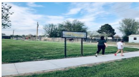
Figure 1. A new walking path around Thornbrough Park.

Action being taken: The Kearny County Wellness Coalition used grant funds and a match from the City of Lakin to install a new walking path around Thornbrough Park. Plans for the future include park lighting, pet waste stations, walking clubs and other community events.