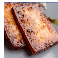
Spicy Tofu and Vegetables